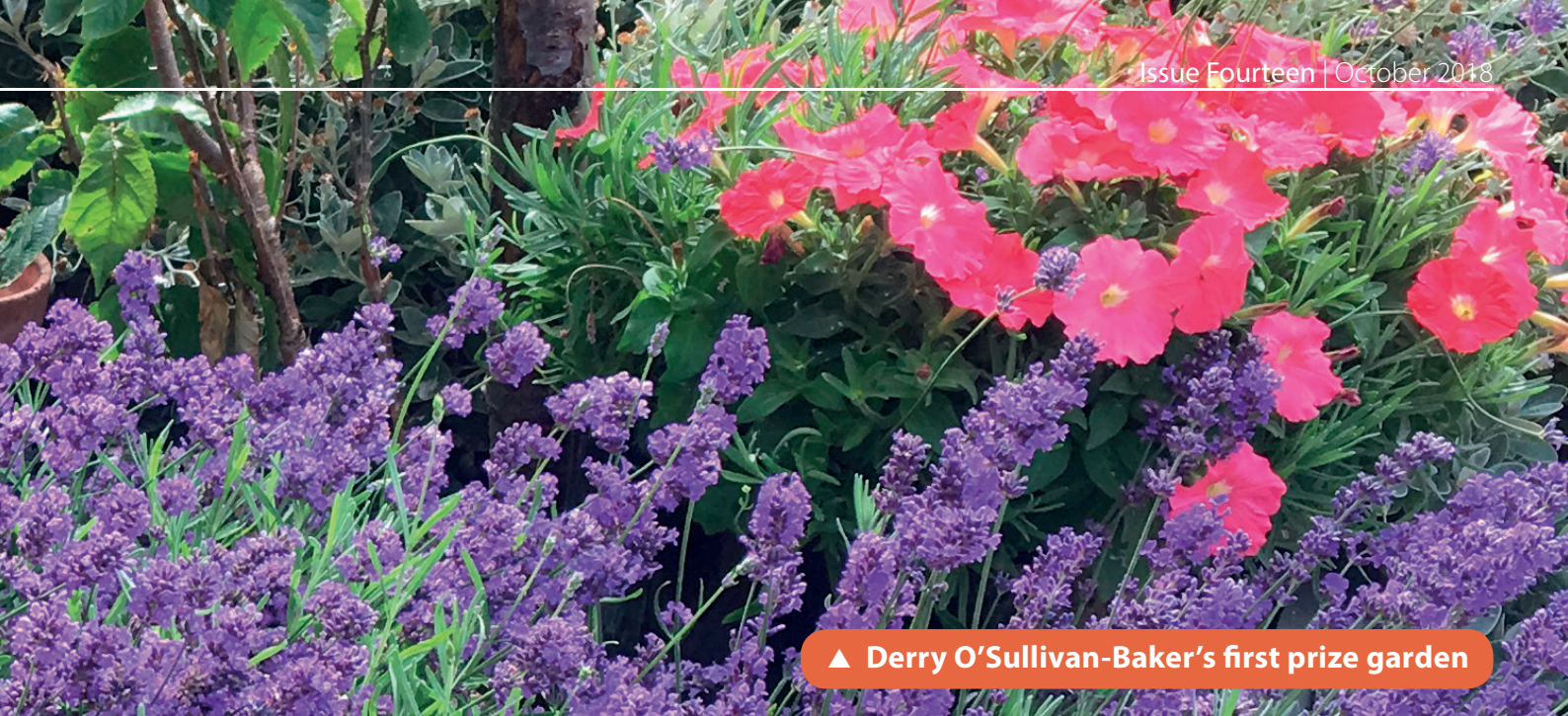
▲ Derry O'Sullivan-Baker's first prize garden

Neighbours Kelly and Darren (pictured second left) won a £10 voucher for their garden, which includes a trail of different coloured lights to guide Kelly, who is partially sighted around the small space.