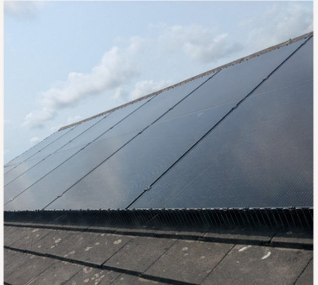
Solar panels on Cashman Lodge