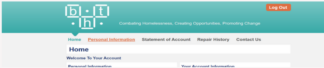
The image shows a view of My Tenancy landing page

As a BHT Sussex tenant, you are able to manage your tenancy at the click of a button by accessing an online portal called MyTenancy. This enables you to report a repair, check your rent account, change your personal details and to read or print a rent statement.